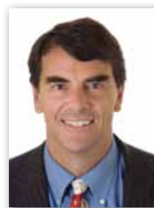
Timothy C. Draper Founder & Managing Director Draper Fisher Jurvetson